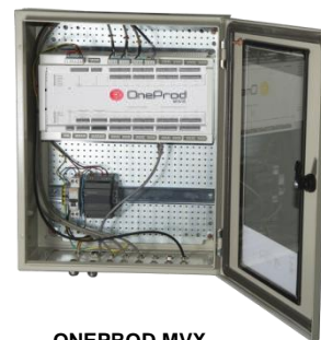
ONEPROD MVX Pre-equipped cabinet (solution on request)