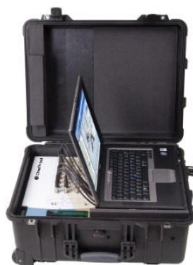
ONEPROD VMS transportable case 16 or 32 channels with BNC connectors (Available with different functionality levels and with or without PC)